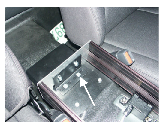
Attach "L" bracket mounting leg (#9) to rear floor filler panel (#6) using ½-20 x ¾" hex bolts and serrated nuts.